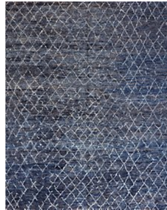
KITTO NAVY BLUE WHITE