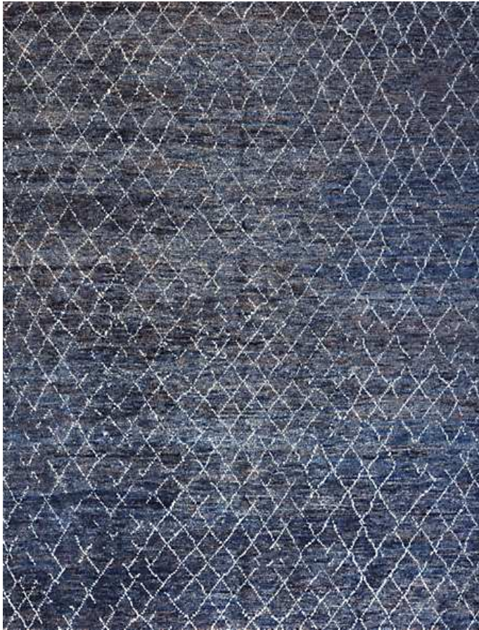
KITTO NAVY BLUE WHITE