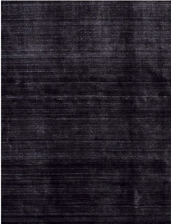
MARISSA DARK CHARCOAL