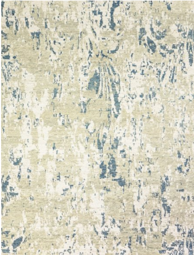
PABLO BLUE GRUNGE