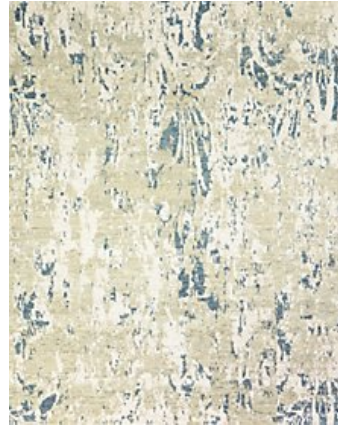
PABLO BLUE GRUNGE