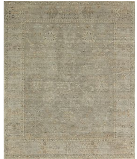
SOMA DARK GREY/LIGHT GREY