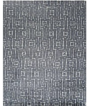
HALLEN DARK GREY