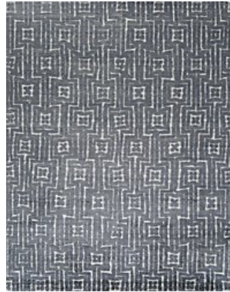
HALLEN DARK GREY