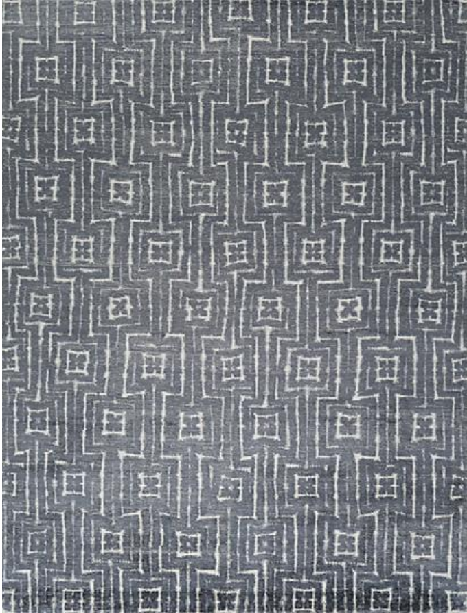
HALLEN DARK GREY