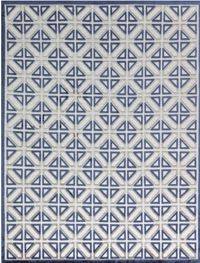
DUCHAMP LIGHT GREY/BLUE