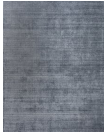
MARISSA BERRY BLUE